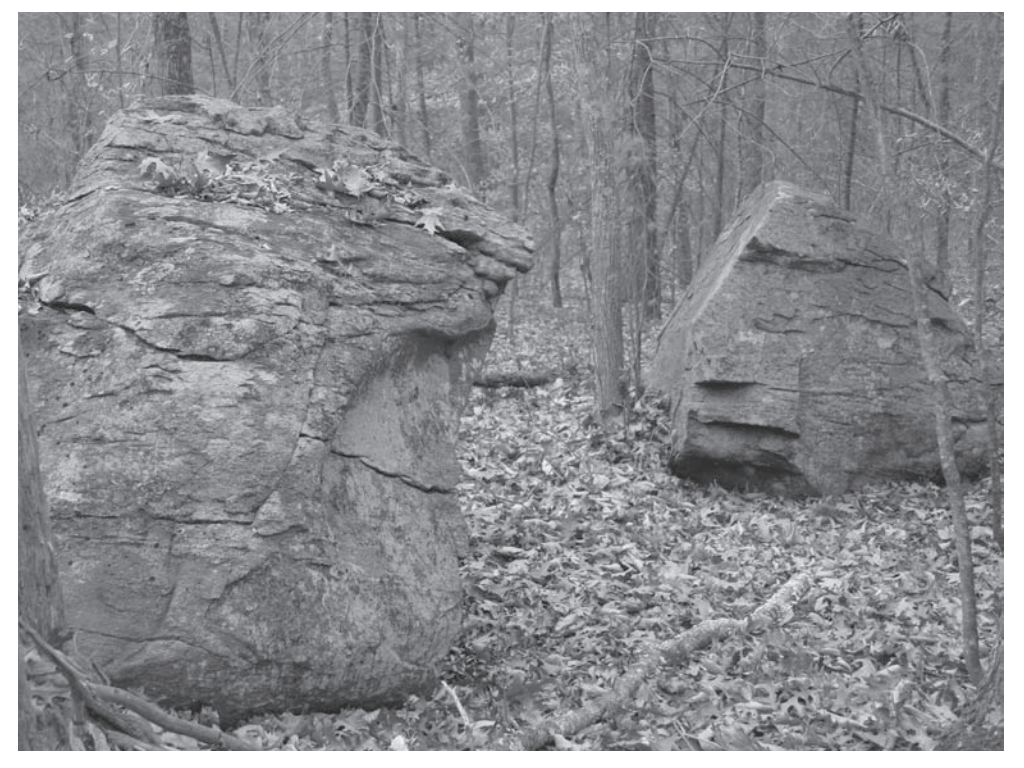
Two glacial erratics along the Ware River.