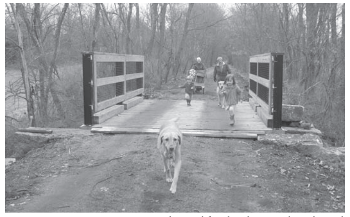
More dogs and families skipping along the trail.

This year there have been some wonderful changes to the trail. The trail has been made wider, all the railroad ties from the start of the trail to the big bridge have been pulled out and the trail has been smoothed out. You no longer need to watch every step you take and can go at a faster pace and enjoy more of the scenery as you walk. The two smaller bridges have been repaired completely (no more quivering knees for me!) and Max no longer has to stop and wait for me or run back repeatedly as we travel down the trail. Next year, they will be fixing the big bridge as well and my trips down the trail will no longer end at the big bridge but can continue all the way to New Braintree with no intimidating bridges to cross.