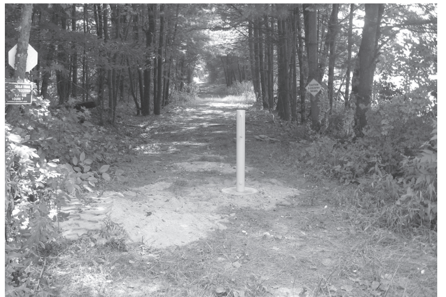
Newly installed bollard at the New Braintree Train Station

It's the newly installed bollards that are visible from the road. The bright yellow posts mimic the style used on other trail en-